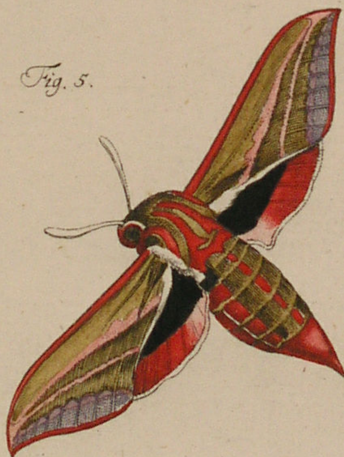
Sphinx. Alis integris.